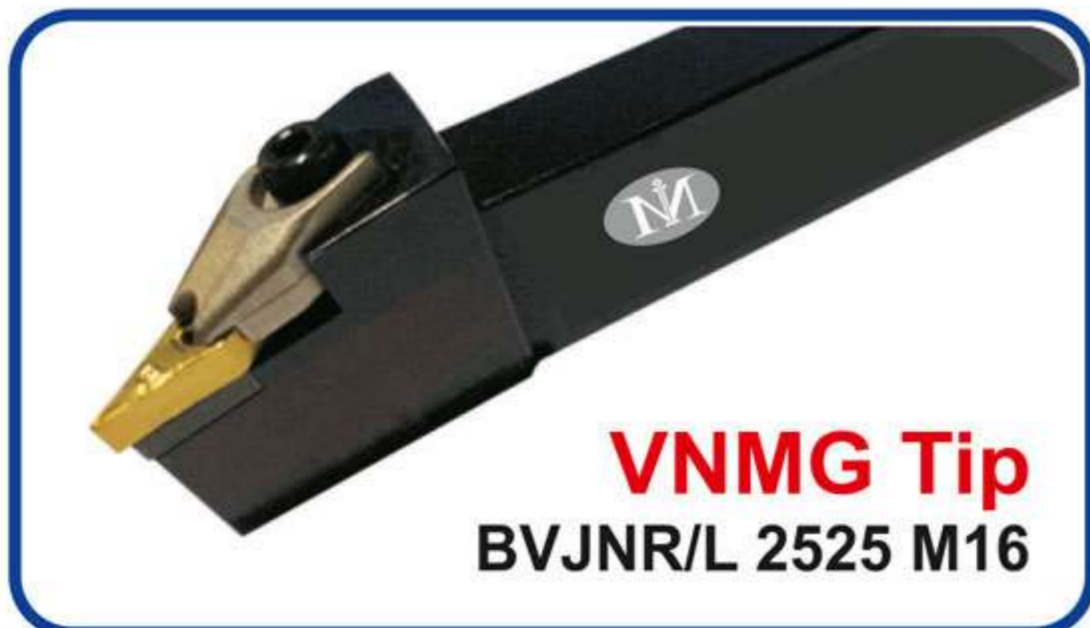
VNMG Tip BVJNR/L 2525 M16