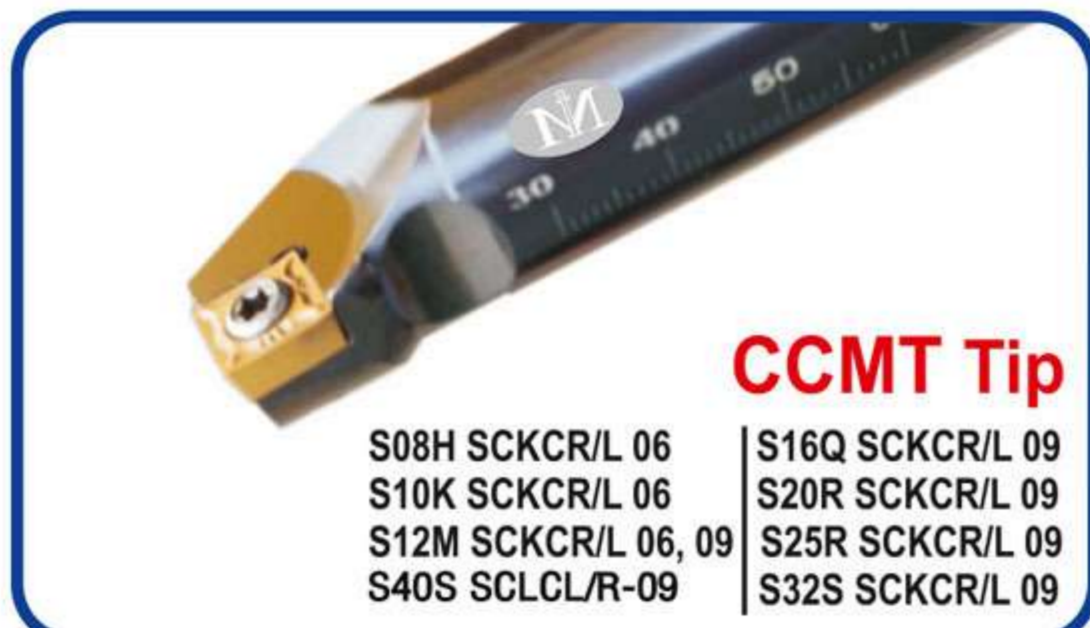
CCMT Tip S08H SCKCR/L 06 | S16Q SCKCR/L 09 S10K SCKCR/L 06 | S20R SCKCR/L 09 S12M SCKCR/L 06, 09 | S25R SCKCR/L 09 S40S SCLCL/R-09 | S32S SCKCR/L 09