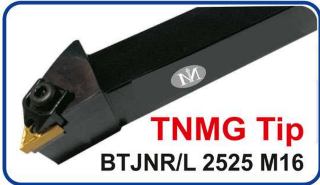
TNMG Tip BTJNR/L 2525 M16