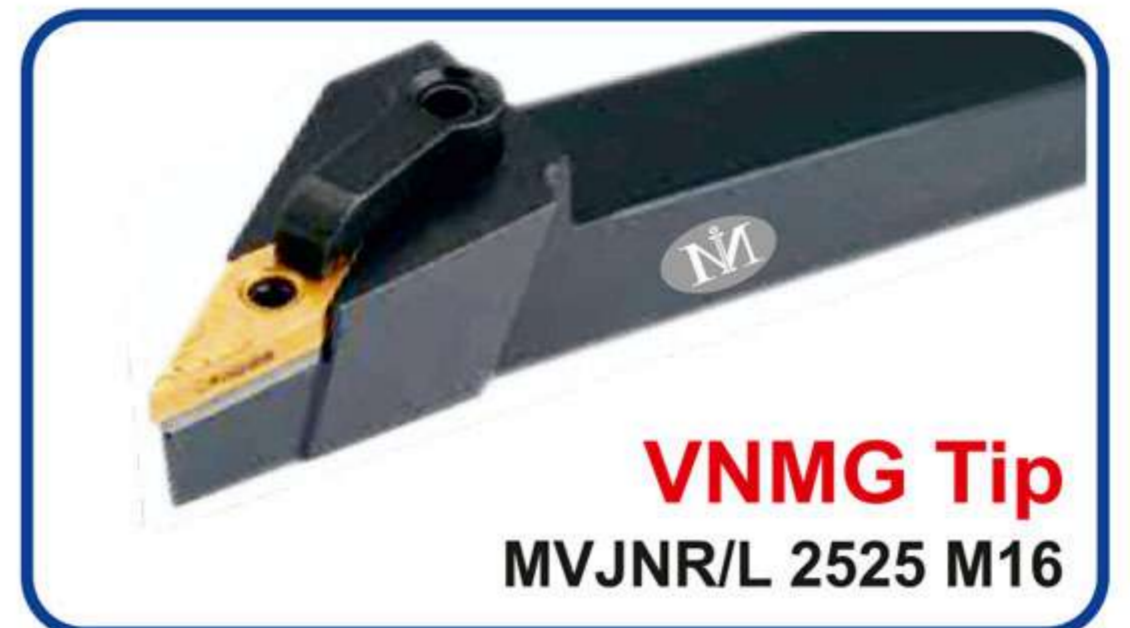
VNMG Tip MVJNR/L 2525 M16