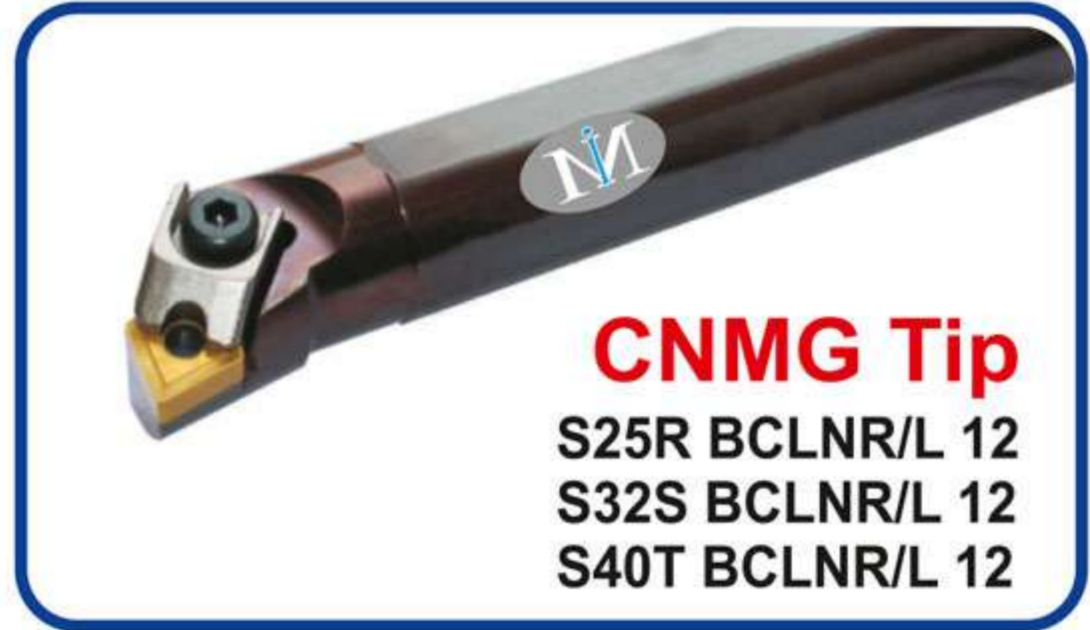
CNMG Tip S25R BCLNR/L 12 S32S BCLNR/L 12 S40T BCLNR/L 12