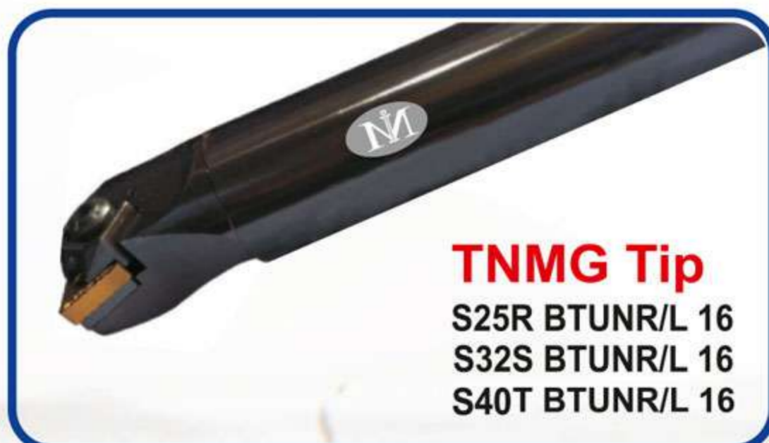
TNMG Tip S25R BTUNR/L 16 S32S BTUNR/L 16 S40T BTUNR/L 16