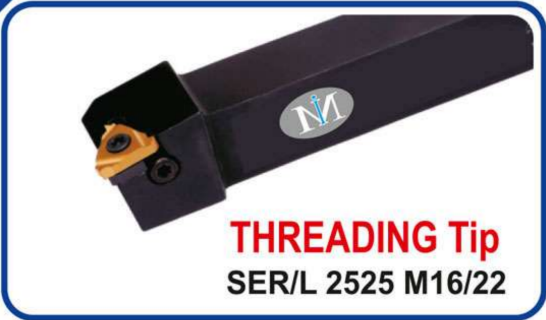
THREADING Tip SER/L 2525 M16/22