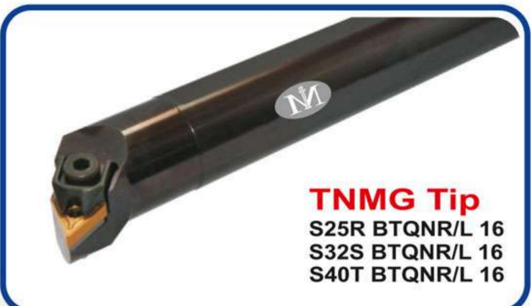
TNMG Tip S25R BTQNR/L 16 S32S BTQNR/L 16 S40T BTQNR/L 16