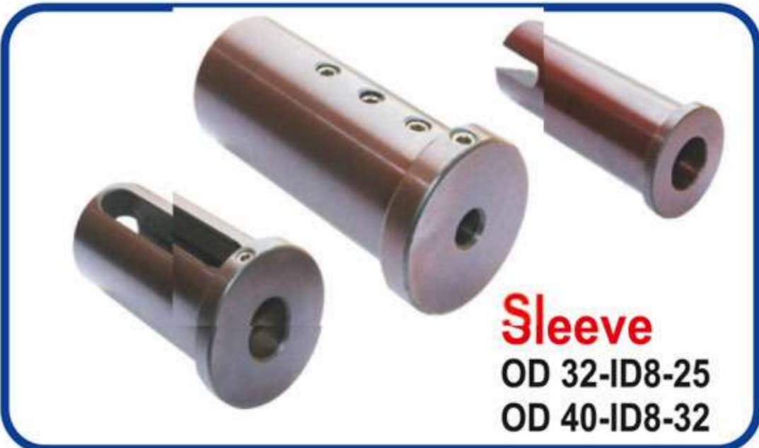
Sleeve OD 32-ID8-25 OD 40-ID8-32