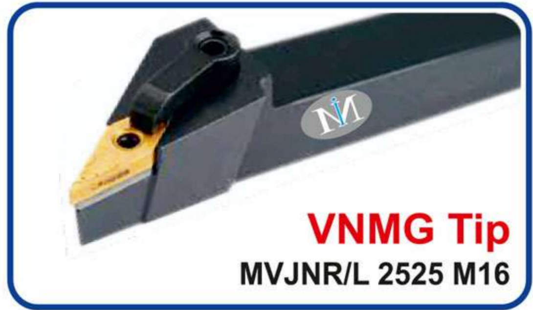
VNMG Tip MVJNR/L 2525 M16