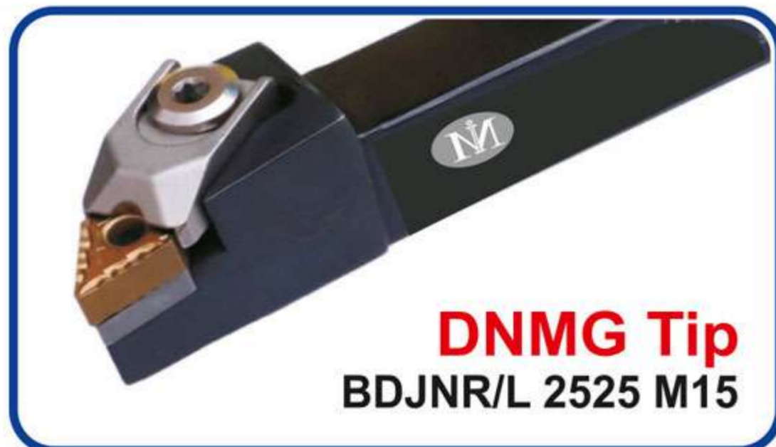
DNMG Tip BDJNR/L 2525 M15