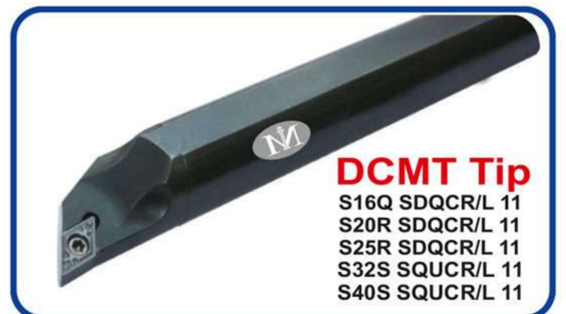
DCMT Tip S16Q SDQCR/L 11 S20R SDQCR/L 11 S25R SDQCR/L 11 S32S SQUCR/L 11 S40S SQUCR/L 11