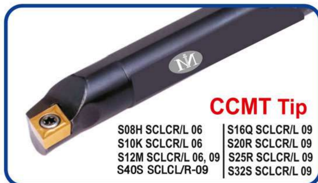
CCMT Tip S08H SCLCR/L 06 | S16Q SCLCR/L 09 S10K SCLCR/L 06 | S20R SCLCR/L 09 S12M SCLCR/L 06, 09 | S25R SCLCR/L 09 S40S SCLCL/R-09 | S32S SCLCR/L 09