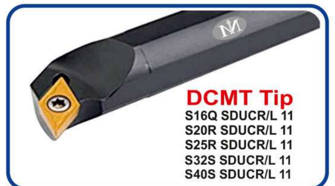
DCMT Tip S16Q SDUCR/L 11 S20R SDUCR/L 11 S25R SDUCR/L 11 S32S SDUCR/L 11 S40S SDUCR/L 11