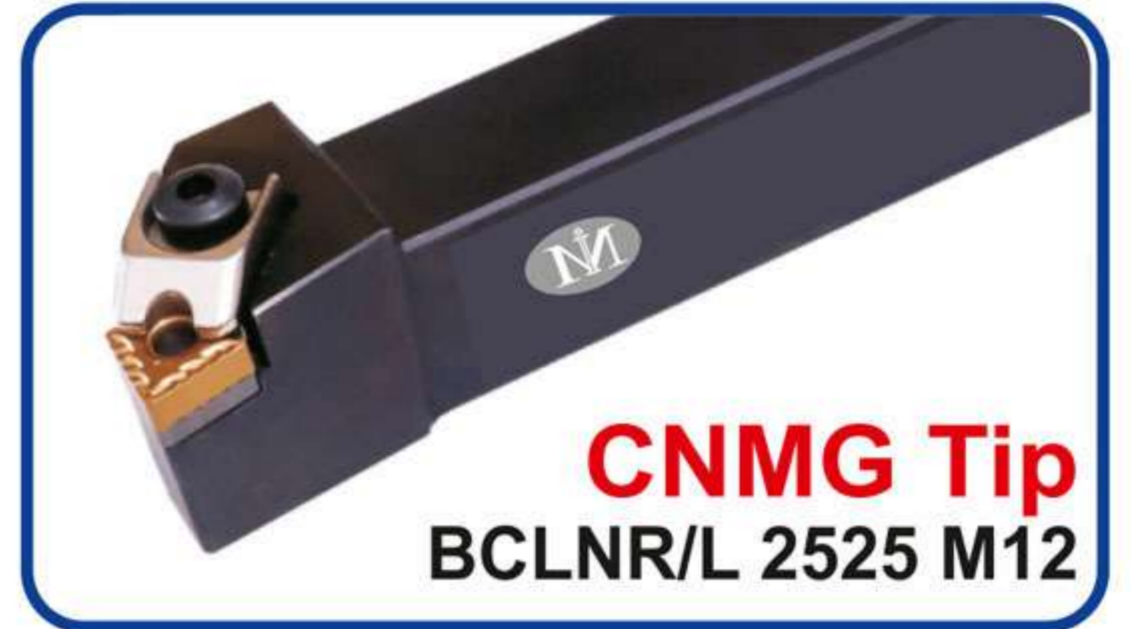
CNMG Tip BCLNR/L 2525 M12