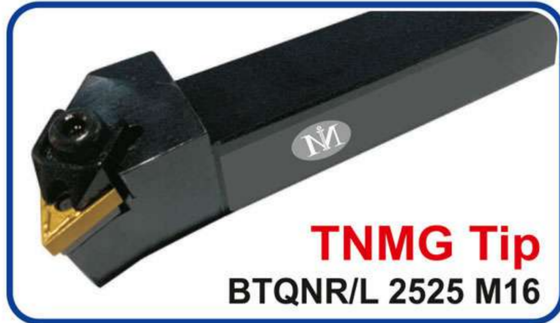
TNMG Tip BTQNR/L 2525 M16