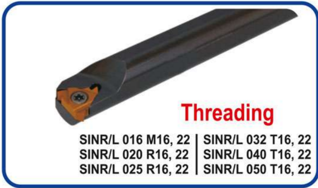
Threading SINR/L 016 M16, 22 | SINR/L 032 T16, 22 SINR/L 020 R16, 22 | SINR/L 040 T16, 22 SINR/L 025 R16, 22 | SINR/L 050 T16, 22