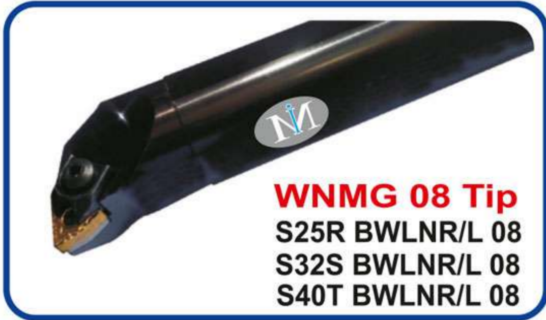
WNMG 08 Tip S25R BWLNR/L 08 S32S BWLNR/L 08 S40T BWLNR/L 08